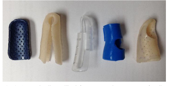
Fig. 2 Assorted splints utilized for non-operative treatment of mallet finger

Okafor et al reported on 31 patients treated conservatively using splints with 5-year mean follow-up and found high