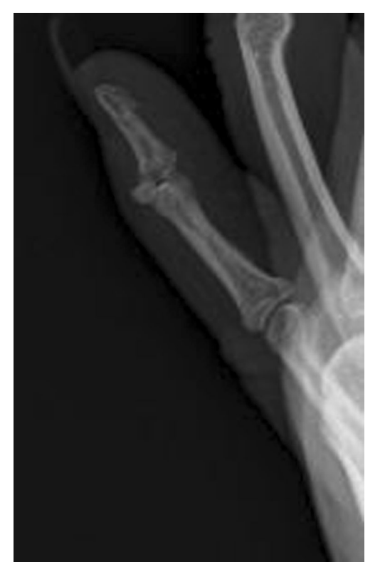
Fig. 1 Lateral of small finger bony mallet with minimally displaced small osseous fragment