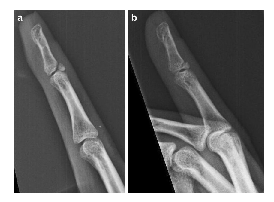
Fig. 3 Non-operative treatment using a plastic stack splint of a bony mallet at day after injury (a) and 6 weeks (b)

sutures are bio-mechanically more stable with no loss of reduction when compared to other techniques [9].